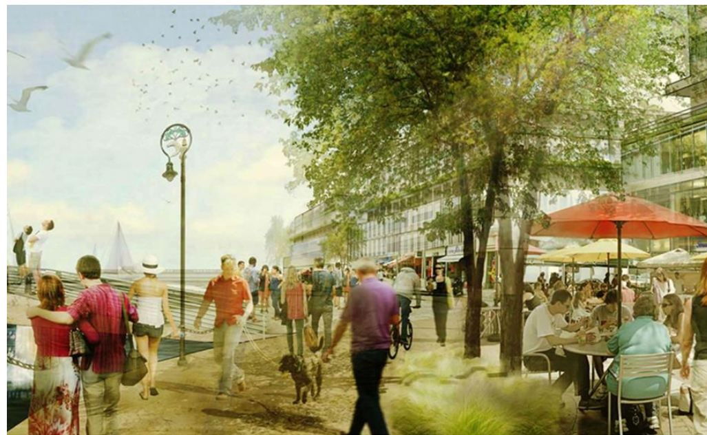
1 Port Street East - Waterfront Promenade